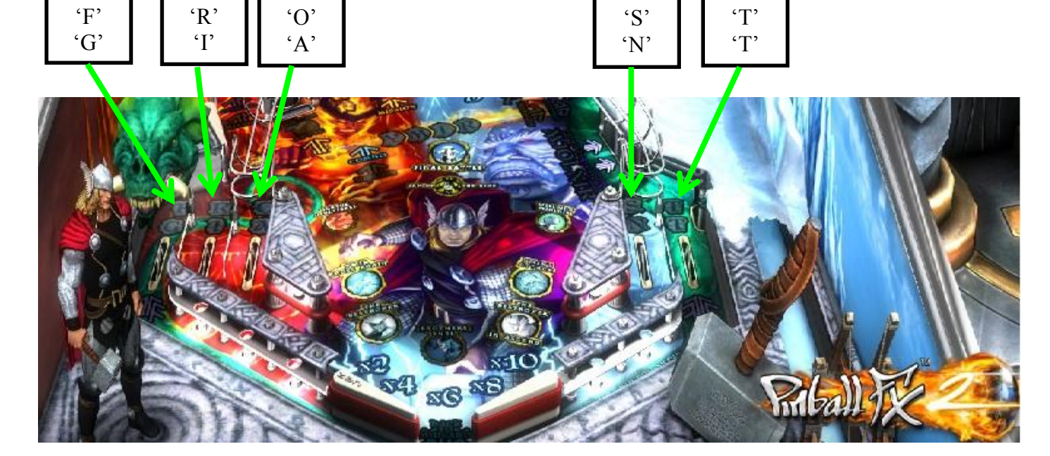
*Note - This Table resets the Kickbacks earned if you lose a Ball*

Both the Left & Right Kickbacks are activated by lighting the letters which spell out 'FROST GAINT'. Lighting up the all the 5 Letters for 'FROST' will activate the Left Kickback, repeat the above for Right Kickback but this time light the 5 Letters for 'GIANT'. Shown below you can see where these are located –