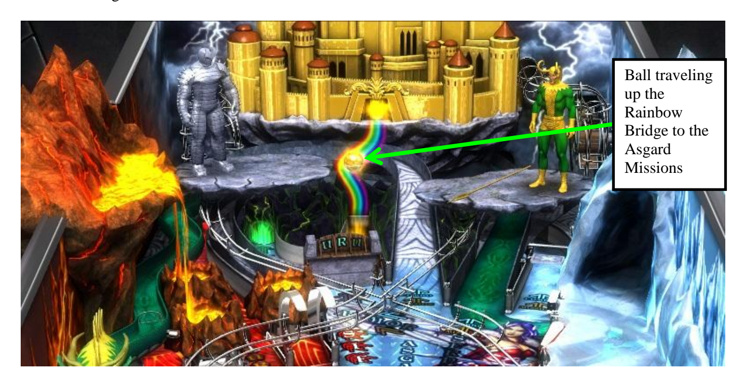
*Note – To cycle through what Mission you wish to tackle first use the Right Trigger to move to the Right and the Left Trigger to move to the Left, then press the 'Launch Button' or just wait for the timer to reach 0 at that time the Mission which is displayed on the Dot-Matrix will be selected automatically.*

This Table has 5 Main Missions - You must first hit the Huku Targets (4) 3 times, then the Asgard Mission Hole (1) will be available. Hit the Ball into that Hole and the Ball will begin to travel up the Rainbow Bridge as shown below—